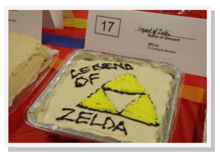
Most Legendary Kids & People's Choice #4 Isaac Cravey